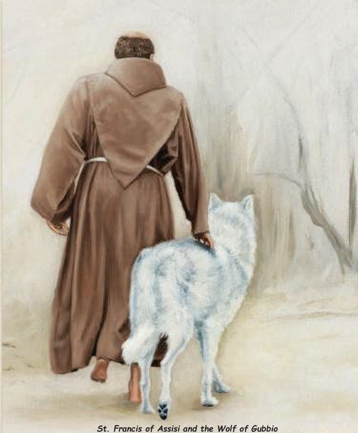
St. Francis of Assisi and the Wolf of Gubbio

SAINT FRANCIS OF ASSISI PARISH • 4700 LONG BEACH BOULEVARD, BRANT BEACH, NJ 08008