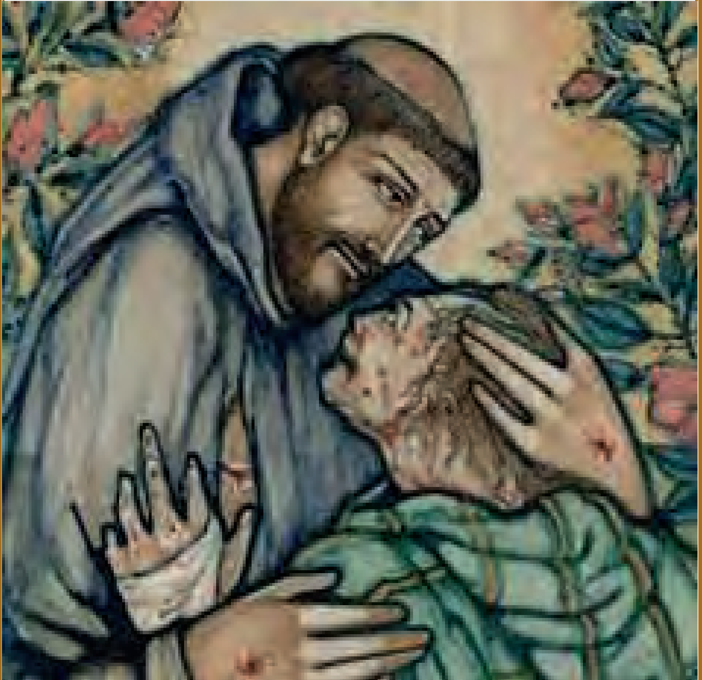
St. Francis of Assisi and the Leper

SAINT FRANCIS OF ASSISI PARISH • 4700 LONG BEACH BOULEVARD, BRANT BEACH, NJ 08008