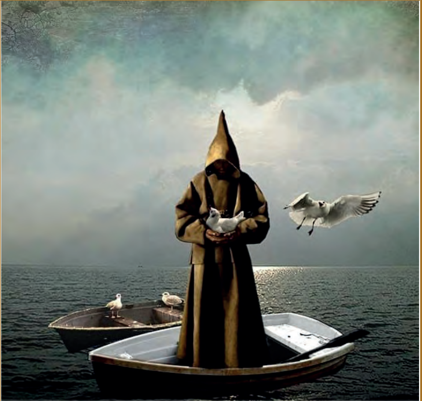
St. Francis of Assisi

SAINT FRANCIS OF ASSISI PARISH • 4700 LONG BEACH BOULEVARD, BRANT BEACH, NJ 08008