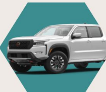
2022 NISSAN FRONTIER S KING CAB VALUED AT: $34,420