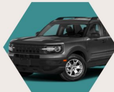
2022 FORD BRONCO SPORT BASE VALUED AT: $28,910 2022 FORD BRONCO SPORT BASE VALUED AT: $29,070

Scan to purchase tickets online Or visit stfrancisparishlbi.org/carraffle