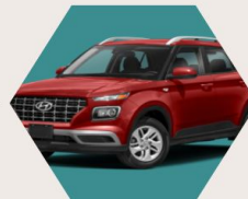
2022 HYUNDAI VENUE SEL VALUED AT: $22,190

THE DRAWING FOR ALL FIVE VEHICLES WILL BE SATURDAY, OCTOBER 8, 2022, AT THE ANNUAL SPAGHETTI DINNER, ST. FRANCIS CENTER GYMNASIUM.