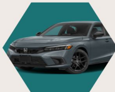
2022 HONDA CIVIC SPORT HATCHBACK VALUED AT: $25,960