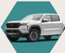
2022 NISSAN FRONTIER S KING CAB VALUED AT: $34,420