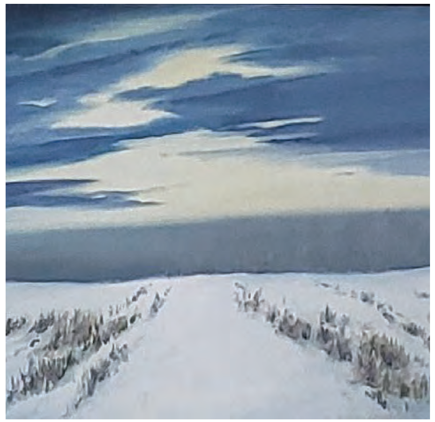
Painting by Chuck Sulkowski

SAINT FRANCIS OF ASSISI PARISH * 4700 LONG BEACH BOULEVARD, BRANT BEACH, NJ 08008