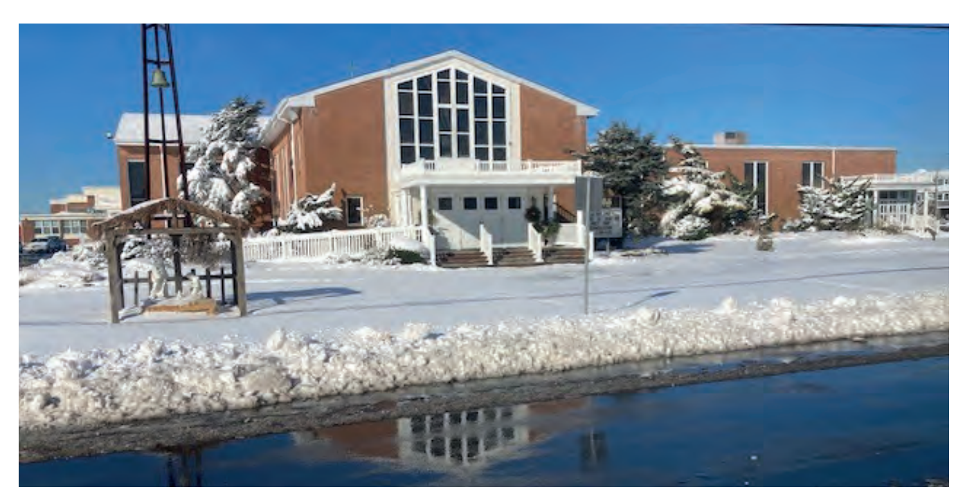
First Snow Storm of 2022