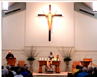
Photo of Ukraine Prayer Service Friday, March 25 th St. Francis Parish