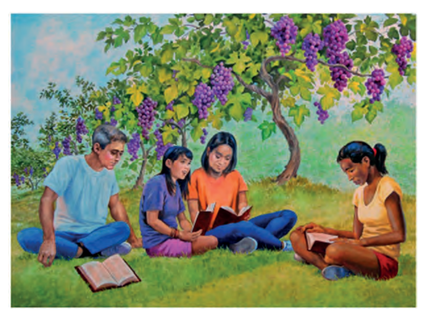
Vine of Life

Lord Jesus, you are the vine of life, we are but branches yearning to give fruit. Grant that the Holy Spirit may nurture your people to remain in you so that we may give the life that you