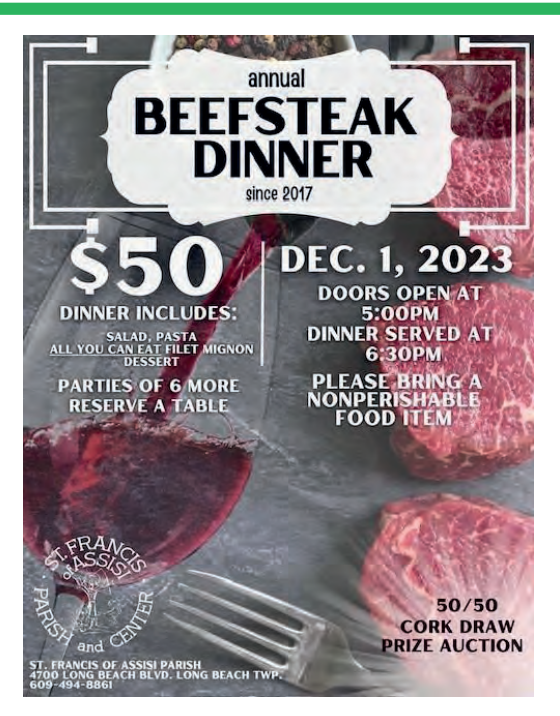
Page 6 - November 5, 2023

A weekend craft show that hosts local artists, crafters, and makers of homemade and handmade items. Perfectly timed right before the holidays for all of your gift-buying needs. You can find something for every one on you list...or maybe a little something for yourself. Please support the Community Center and our talented vendors at this year's Holiday Craft Show.