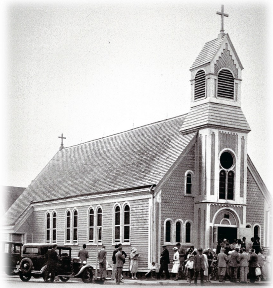
St. Thomas Aquinas Church c. 1935